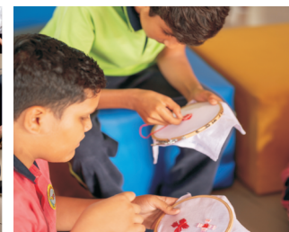
Needle & Thread Work