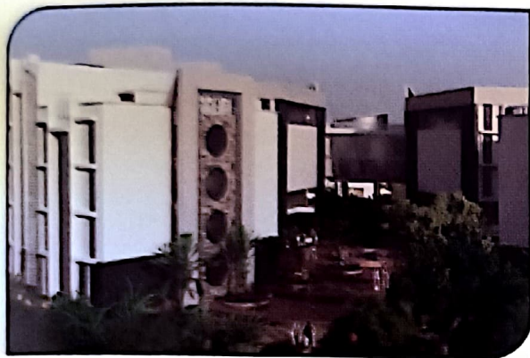
Vapi Public School (VPS)