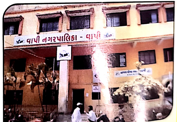
Vapi Nagar Palika