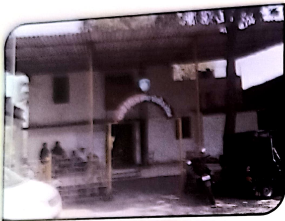
GIDC Police Station