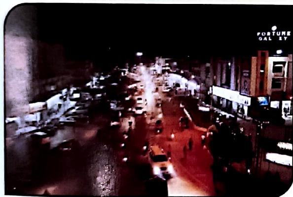
Gunjan Char Rasta by Night