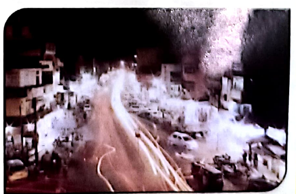
Vapi Town by Night