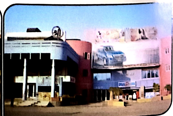
Shree & Jayshree Multiplex