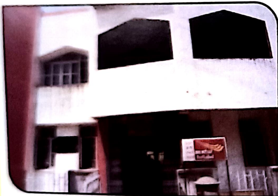
Vapi Town Post Office