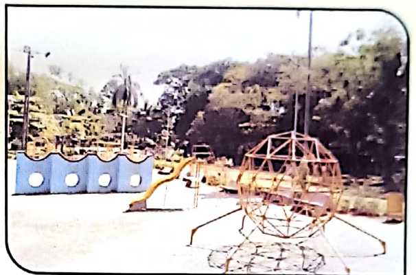
GIDC Notified Garden