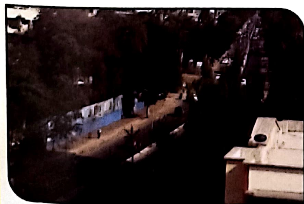
Vapi Daman Road