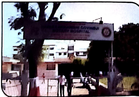
Haria Rotary Hospital