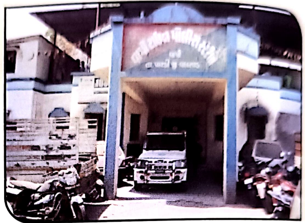
Vapi Town Police Station