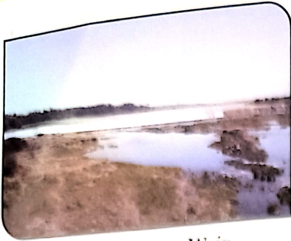
Daman Ganga Weir