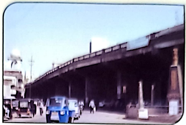
Vapi Zanda Chock