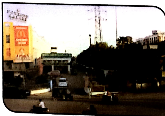
Fortune Galaxy Hotel