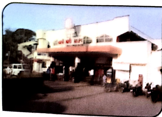
Vapi Railway Station