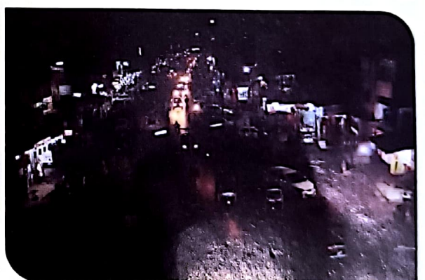
A bird's eye view of Vapi Town