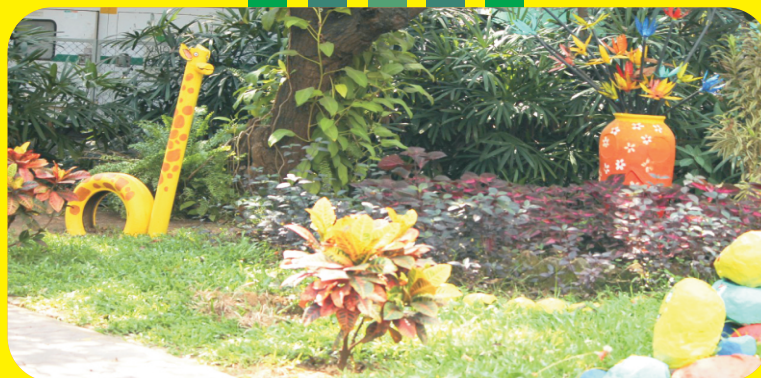
CREATIVE CORNERS OF THE CAMPUS